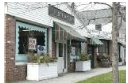
Clockwise from left: Canaan, Cornwall, Salisbury, Kent

S troll down Main Street in almost any town in the Northwest Corner and you will see evidence everywhere that hard times have come this way. “Closed,” “Final Sale,” “For Rent,” “Going Out of Business”—the unhappy signs of recession are all around. In some towns the commercial centers have been crippled; others seem to have given up the ghost altogether.